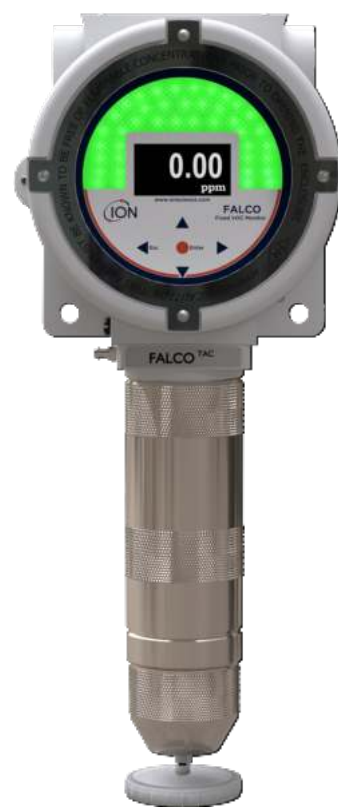
Pumped TAC (10.0eV) model