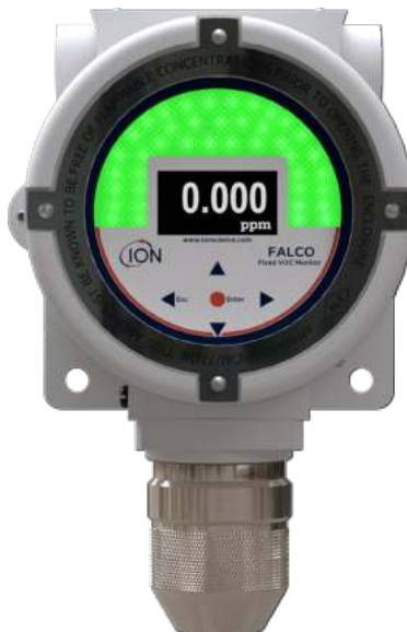
Diffused 10.6eV model

Registering your product online within one month of purchase will extend its warranty.