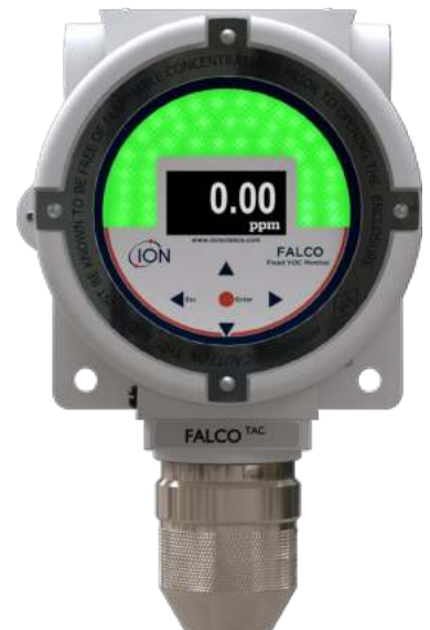
Diffused TAC (10.0eV) model