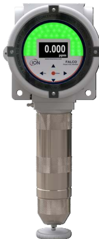
Pumped 10.6eV model

Registering your product online within one month of purchase will extend its warranty.